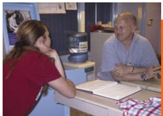
One of our staff working with a client at the Sir Julian Hodge Hostel